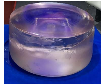
20 inch Sapphire boule to be cut and polished for space research lens

Demand for synthetic sapphire is still growing strongly on the back of the LED market. Demand from the optical industries is also increasing significantly for laser lenses and scientific equipment.